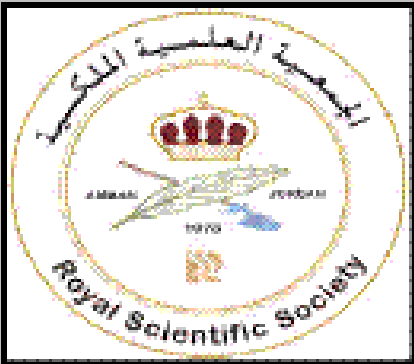
Certificate of Conformity