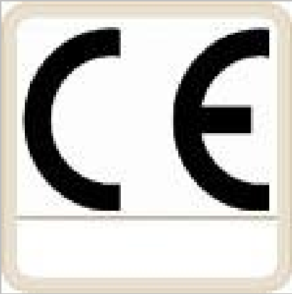
CE Marking. UIC – Lift control system